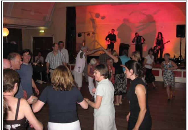
Dancing the night away at the Ceilidh to the renowned group Beggars Belief