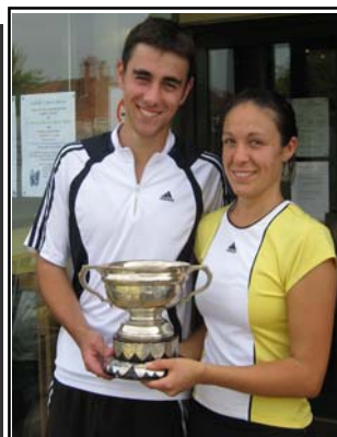
Mixed Doubles Winners 2008