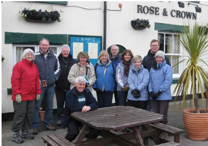
The brave few who disregarded the severe winter conditions.